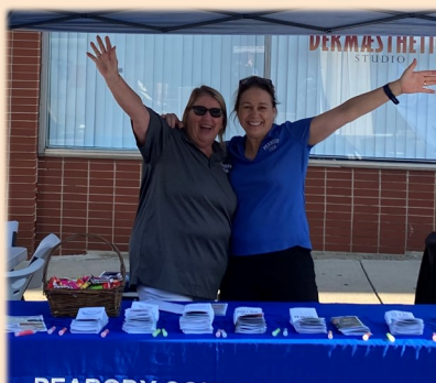
PEABODY COUNCIL ON AGING 79 Central Street Peabody International Festival 2024!