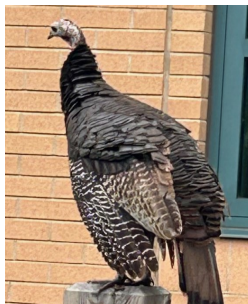
Our new security system