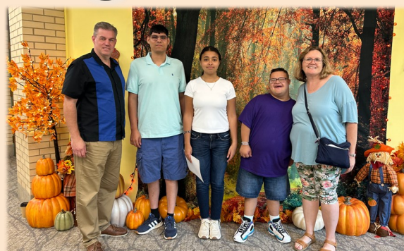
Welcome Back Post High School Students!